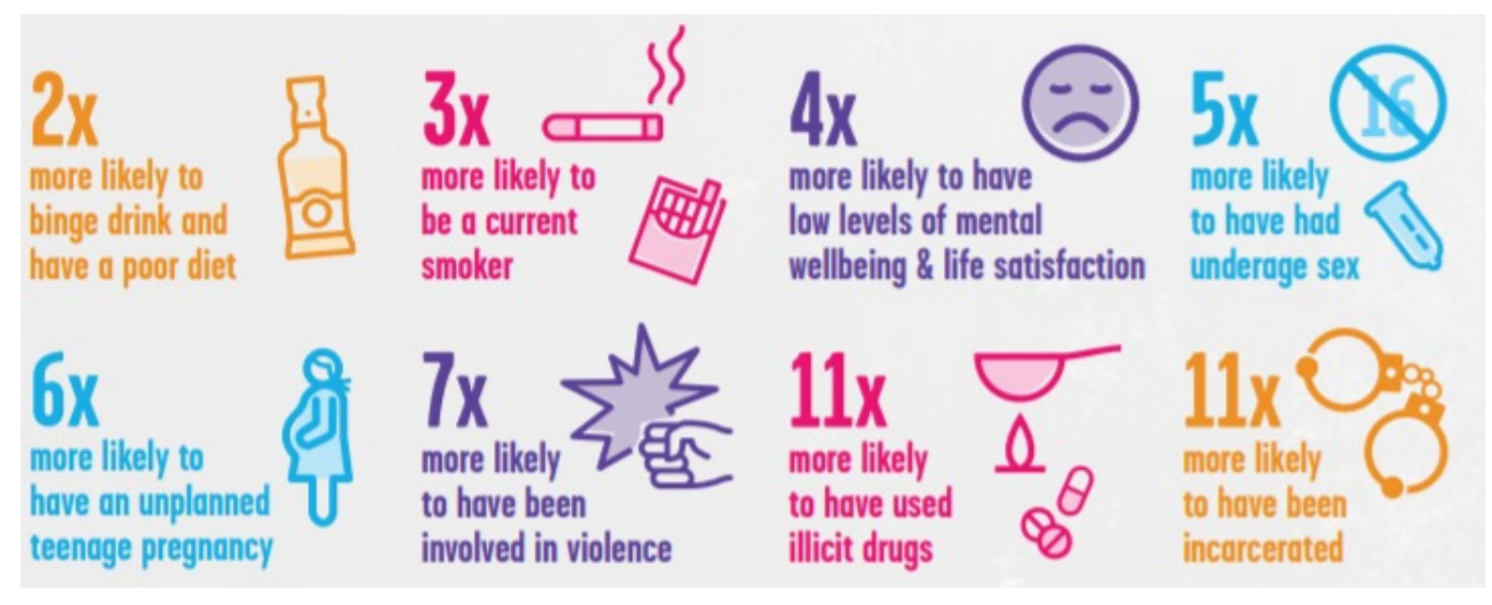
Figure 1: Adverse Childhood Experiences

Individuals who experience 4 or more Adverse Childhood Experiences or traumatic events have an increased risk of high-risk behaviours and poorer outcomes as adults,<sup>45</sup> as shown in the graphic below.